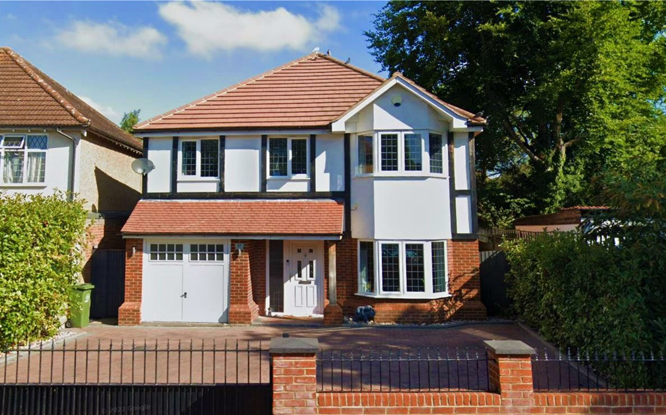
Beddington Gardens, Carshalton, SM5 Approximate Area = 1920 sq ft / 178.4 sq m (includes garage) For identification only - Not to scale