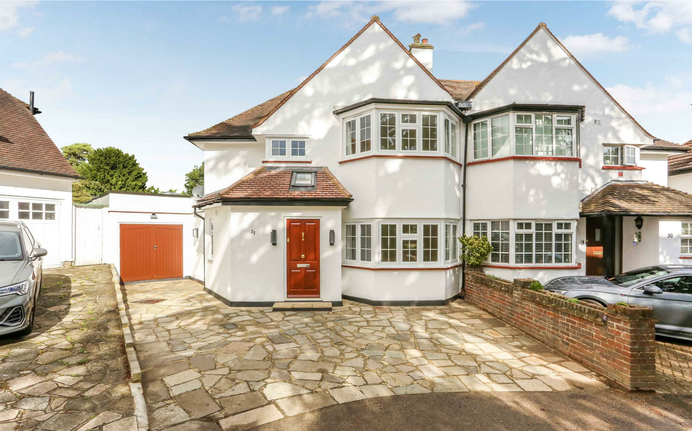
THE GALLOP, SM2

TOTAL APPROX FLOOR PLAN AREA INCLUDING GARAGE 1629 SQ.FT (151 SQ.M) TOTAL APPROX FLOOR PLAN AREA EXCLUDING GARAGE 1588 SQ.FT (147 SQ.M)